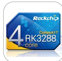
Rockchip RK3288, Quad-core Cortex A17 up to 1.8GHz