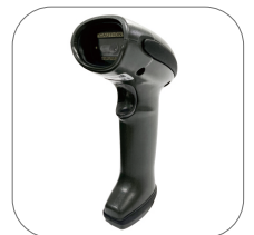
JAW-6208 1D/2D Scanner 617nm LED Aimer, White LED