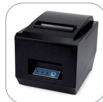
JAW-8250 58/80MM Thermal Printer