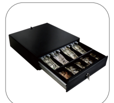
JAW-400DK Bill and Coin Optional Automatically Open