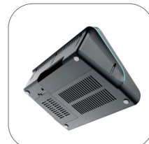
ODM Service for color line