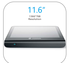
11.6 inch TFT LED Backlight Projective Capacitive Touch Screen